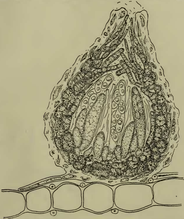
Text-Fig. 2. The perithecium of Nectria egens in section: \times 800 .

into the air vegetatively: and I did not succeed in detaching them. At the edge of a leaf they follow round the grooves to the other side and they progress from leaf to leaf along the stem. They may reach young leaves which are half-grown but they do not penetrate the growing-point, and they die off from old leaves which are browning. There are no haustoria and the cells of the host suffer no obvious harm.