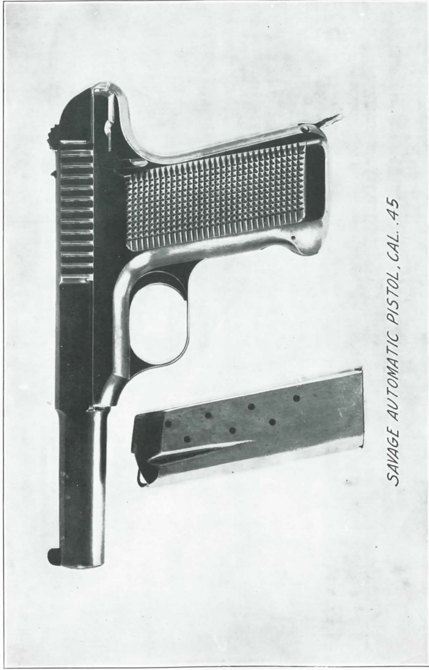
SAVAGE AUTOMATIC PISTOL, CAL. .45