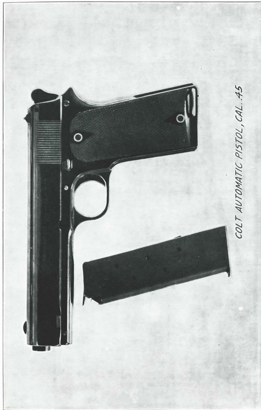
COLT AUTOMATIC PISTOL, CAL. .45