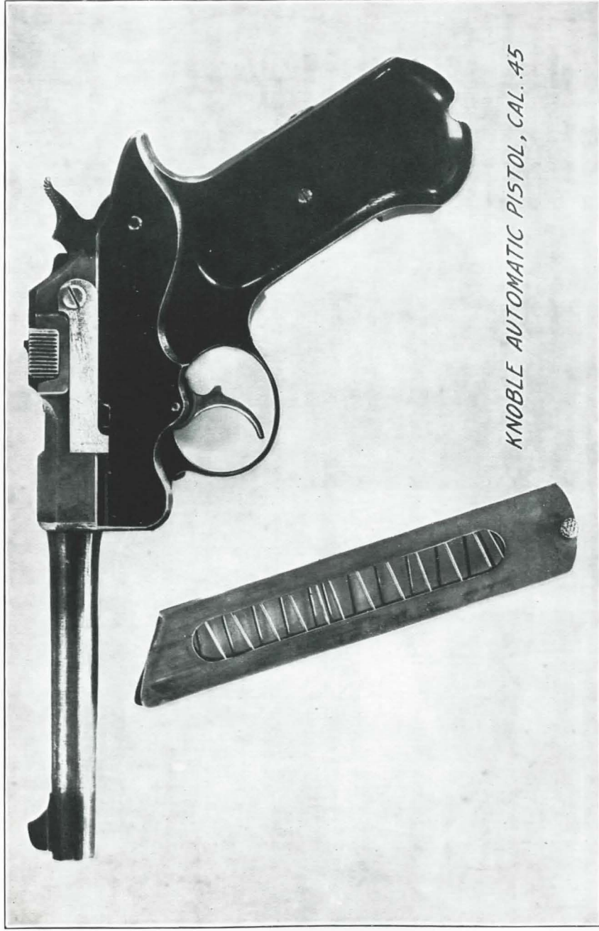
KNOBLE AUTOMATIC PISTOL, CAL. .45