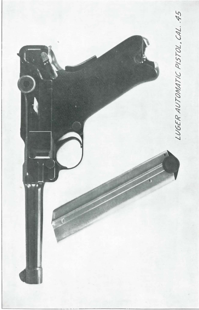
LUGER AUTOMATIC PISTOL, CAL. .45