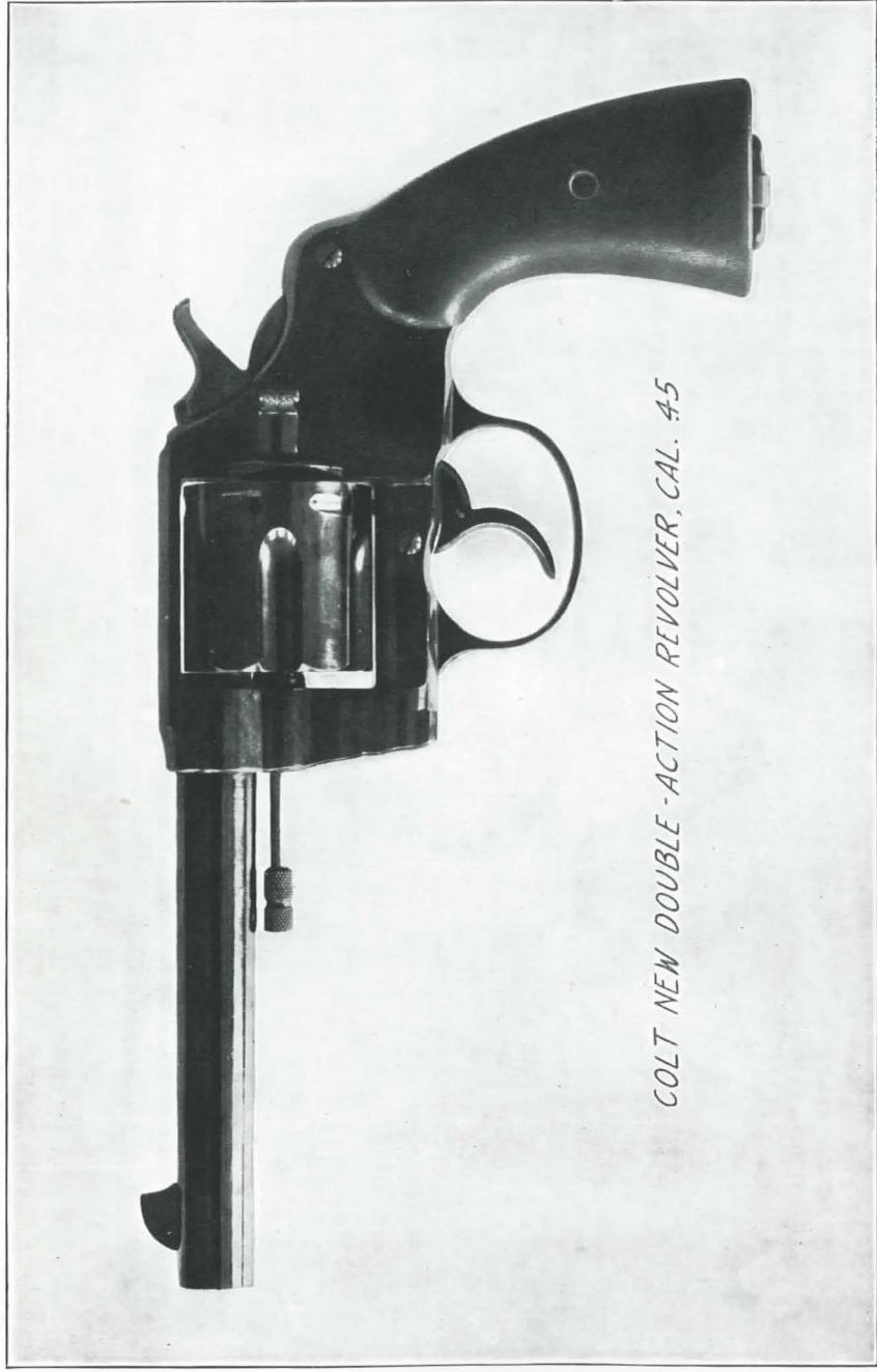
COLT NEW DOUBLE-ACTION REVOLVER, CAL. .45